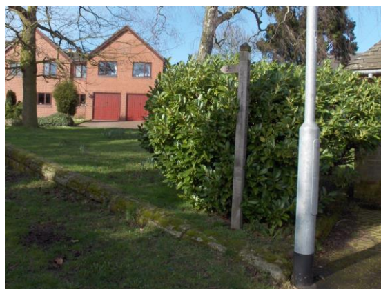
Stramshall Village Green