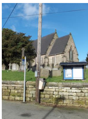
St Michael's Church

Great emphasis is also placed upon the action plan will not just delivering some priority issues raised in phase one but to engage all village residents. It is important to stress that the initiative includes residents from Spath in planning for the future.