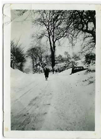
St Michael's Road