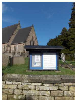
Church Notice Board