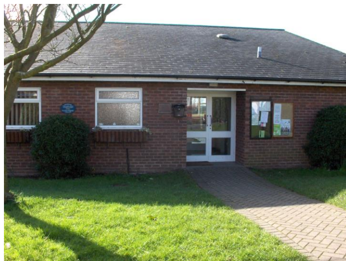
Stramshall Village Hall