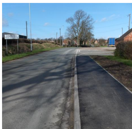
Spath to Stramshall Road