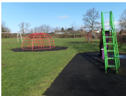
Stramshall Play Area